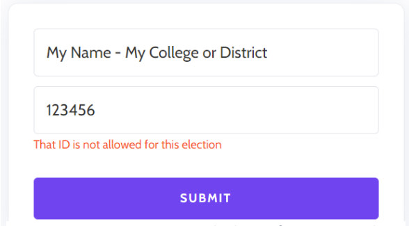
Figure 3. Error message in RankedVote if voting is not live.