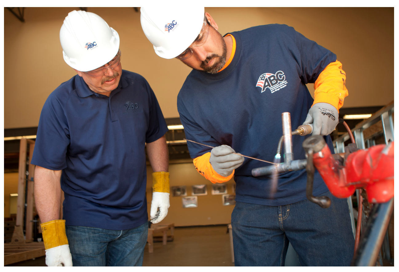
A San Diego Continuing Education CTE student practices welding techniques with his instructor.